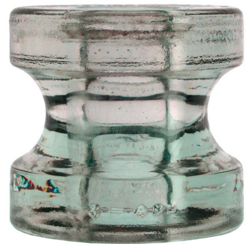
CD 1050 REAR