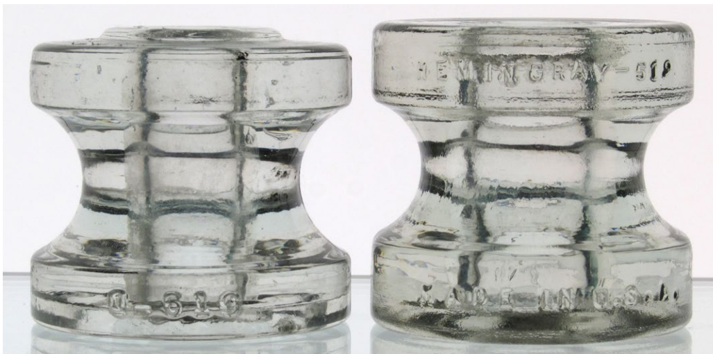
CD 1053 D-519 [020] (BACKWARDS D)