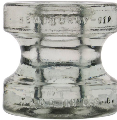
CD 1050 FRONT

You can see in the photo below a comparison between the CD 1053 and CD 1050. Notice that the CD 1053 has a stepped "ring" around the top of the hole, whereas the CD 1050 is flat. One other less apparent difference is the hole size: the CD 1053 has a 0.6" hole, whereas the CD 1050's hole is slightly larger at 0.75".